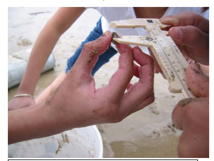
Students measure a sand crab shell length with calipers, then determine the crab's gender and record the data, which is eventually posted on a NOAA website.

their schools, but has changed our program as well. There is something exceptional about sharing experiences in nature with children that have rarely left their own town!