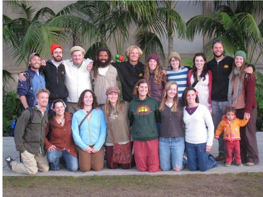
The 2008-2009 Loma Mar Community

Spring is upon us in the Pescadero Valley and life is unfolding in front of our eyes. As we are finishing our “winter” school session, it is nice to reflect on the learning, creativity and positivity that has taken flight at our site. We have served communities as far as Winters Middle School and as near as Milpitas, some of which have been coming to our site since the beginning of our program 30 years ago. The children have learned to recognize their connection to nature. Regardless of what community they come from, we have