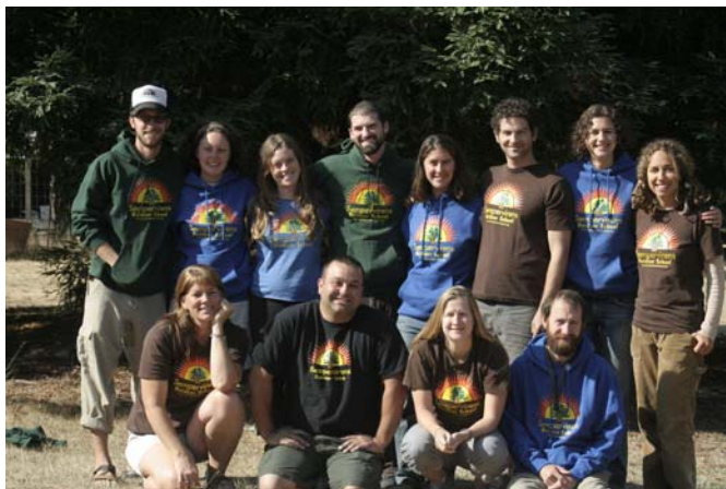
2008-2009 Sempervirens Outdoor School Staff

Rain! Finally winter has come to Sempervirens and the waterfall on our new trail is finally flowing. We have had 10 inches of rain in Boulder Creek in the last three days and the mushrooms, banana slugs, frogs and salamanders are loving it!