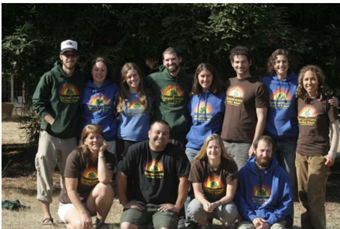
2008-2009 Sempervirens Outdoor School Staff

Rain! Finally winter has come to Sempervirens and the waterfall on our new trail is finally flowing. We have had 10 inches of rain in Boulder Creek in the last three days and the mushrooms, banana slugs, frogs and salamanders are loving it!